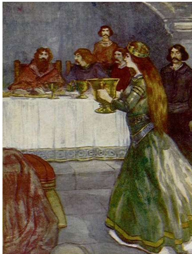
Rowena came into the room carrying a beautiful golden cup.

rather afraid of them, so he said nothing, but allowed them to build their fortress. It was called Thong Castle, and stood not far from Lincoln, at a place now called Caistor.