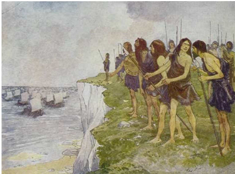
THE SHORE WAS COVERED WITH MEN READY FOR BATTLE

be enough with which to conquer the wild men of Britain. One fine day he set sail from France and soon came in sight of the island. The Britons in some way or other had heard of his coming and had gathered to meet him. As he drew near, Caesar saw with surprise that the whole shore was covered with men ready for battle. He also saw that the place which he had chosen for landing was not good, for there were high, steep cliffs upon which the Britons could stand and shower darts upon his soldiers. So he turned his ships and sailed along the coast until he came to a place where the shore was flat.