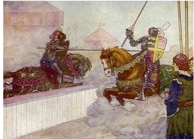
The Count rode again and again at Edward till his lance was splintered in his hand.

not touch it." So the count was obliged to give up his sword to a common soldier, which, for a true knight, was the deepest disgrace.