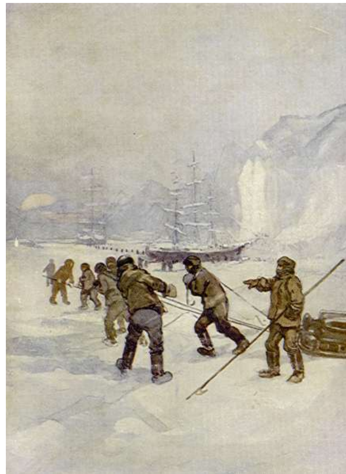
THE SHIPS WERE CALLED THE "TERROR" AND THE "EREBUS"

already been on two voyages of discovery to Arctic regions, was put in command.