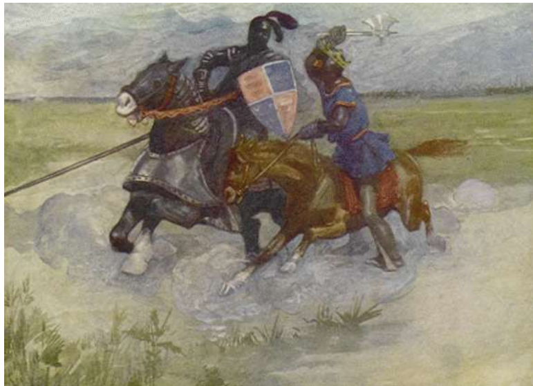
Bruce lifted his battle-axe high in the air, then brought it crashing down upon the helmet of Bohun.

Soon the English horsemen were seen flying from the field, and Randolph, joyful and victorious, returned to his place. He had recovered the rose which had fallen from his crown.