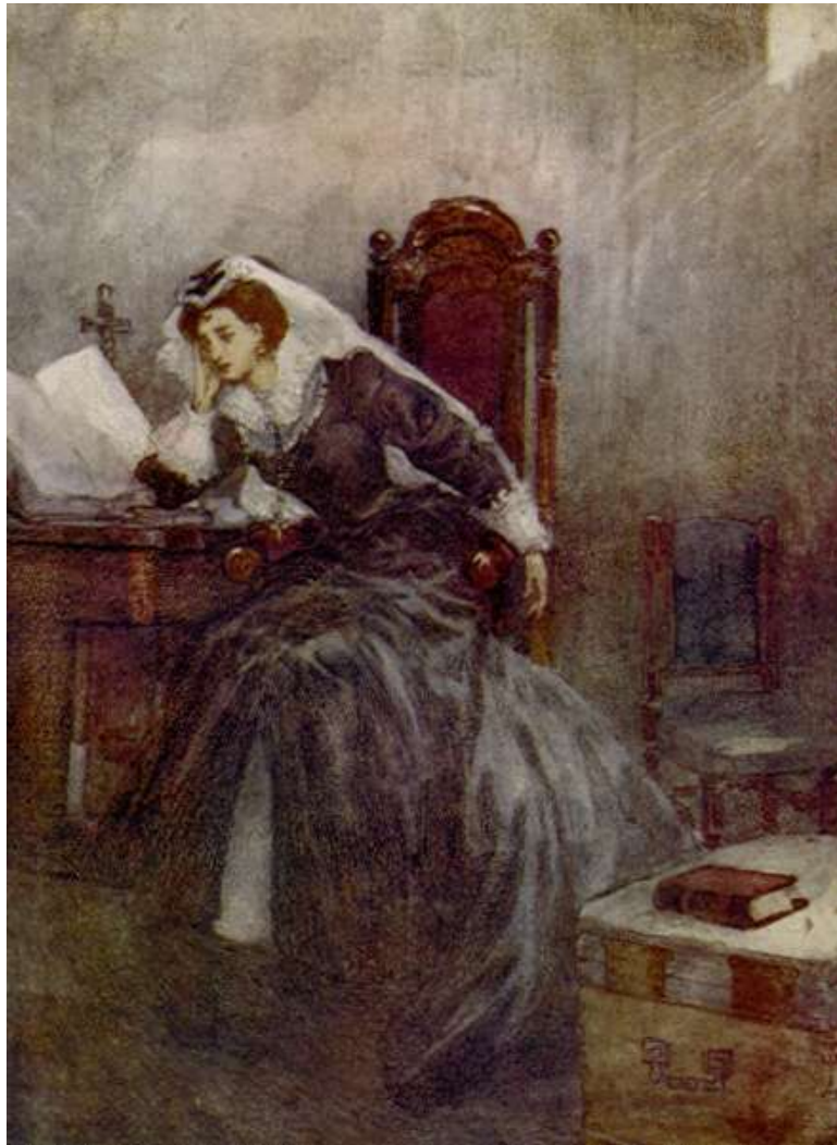
"FOR NINETEEN YEARS THIS POOR QUEEN WAS KEPT IN PRISON"

Queen was kept in prison. She was moved from castle to castle, for it seemed as if no place was strong and safe enough to keep her from her friends. At last she was shut up in a castle called Fotheringay.