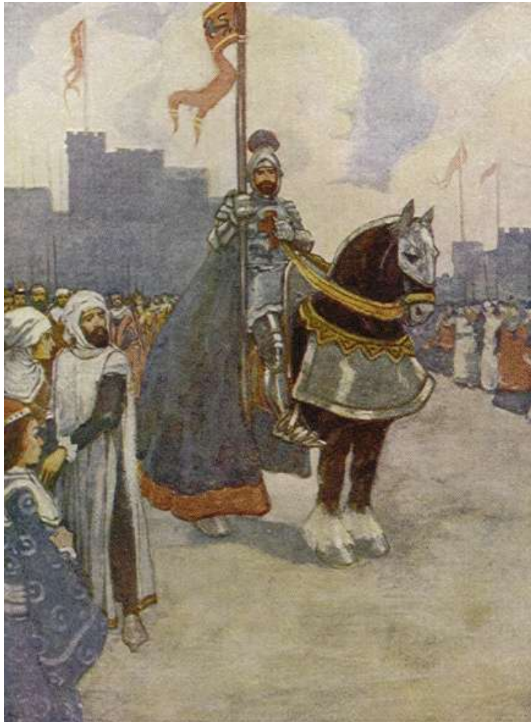
"RICHARD WENT AWAY TO PALESTINE"

at home and looking after his kingdom as he ought to have done, he went far away to Palestine to fight.