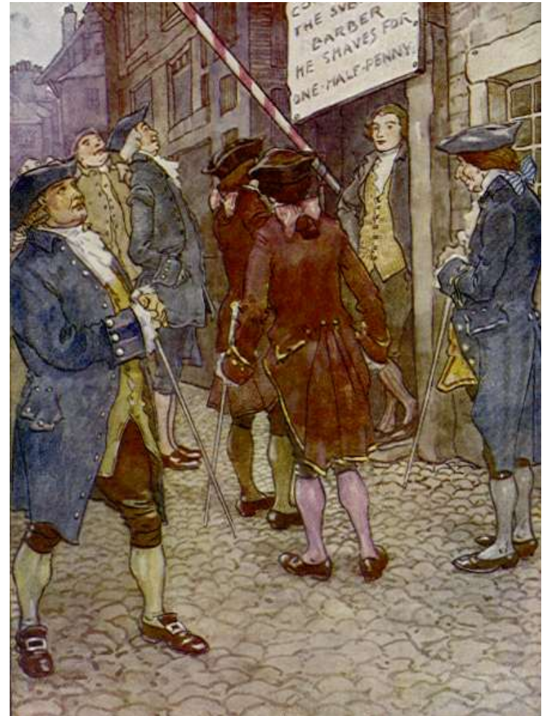
"RICHARD'S SHOP SOON BECAME THE FASHION"

the sign of a barber's shop. Then he waited for people to come to have their hair cut and to be shaved.