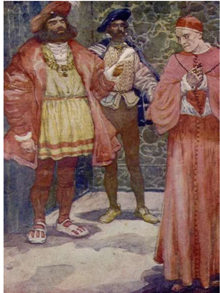
"HENRY SENT WOLSEY AWAY FROM COURT"

The King sent messengers after her to call her back, but she would not return. Nor did she ever again come into the court.