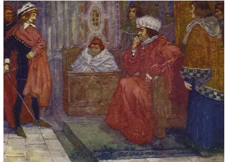
"For your contempt and disobedience I send you to prison," said Judge Gascoigne.

Prince Hal was very angry at being spoken to like this. He was so angry that he hardly knew what he was doing, and, springing forward, he struck the judge in the face.