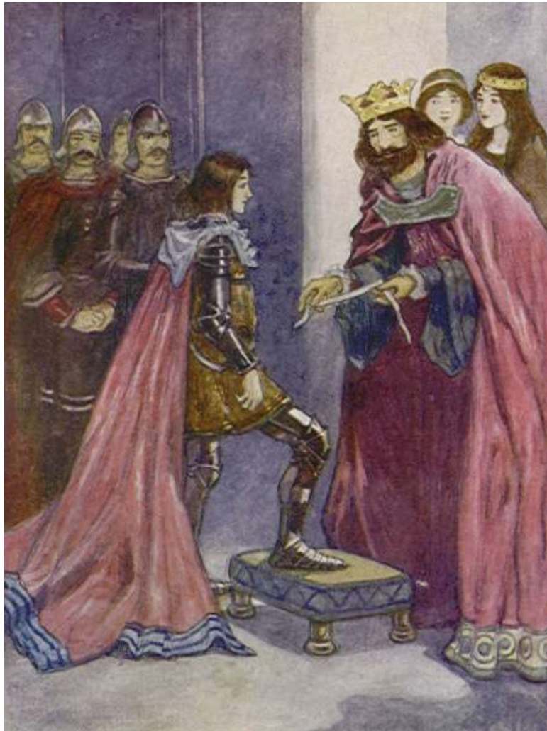
The King made the Black Prince a Knight of the Order of the Garter.

his arms and kissed him. “Dear son,” he said, “God give you strength to go on as you have begun. Bravely and nobly have you fought, and you are worthy to be a king. The honour of the day is yours.”