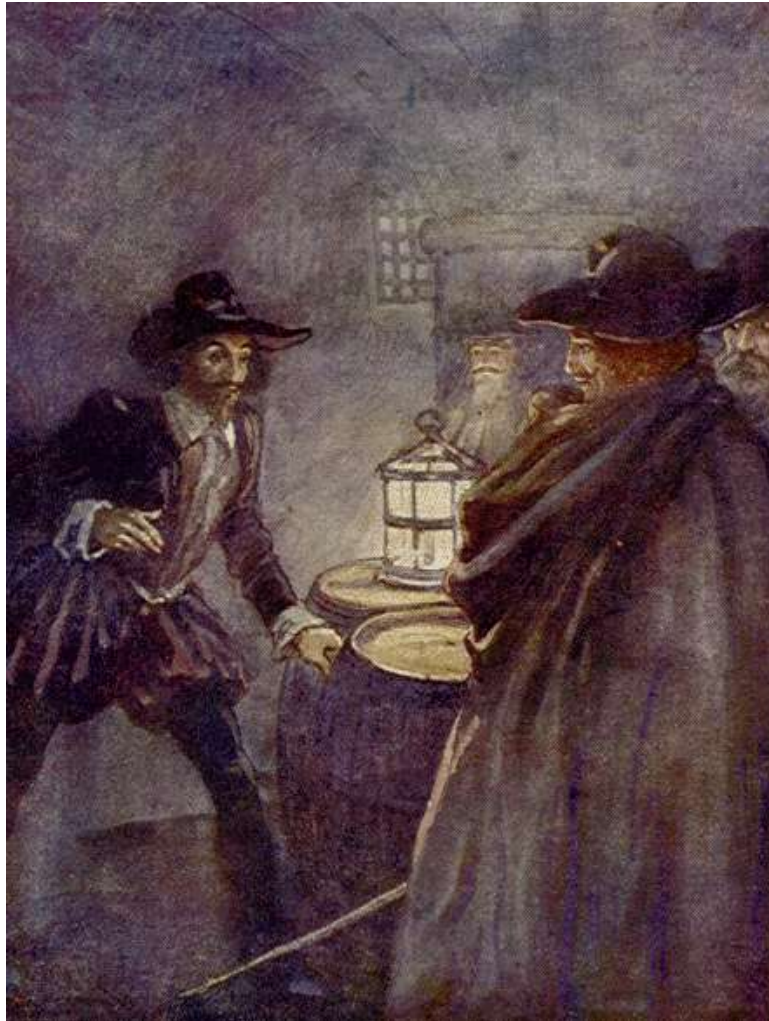
STERN MEN WITH DRAWN SWORDS CLOSED IN UPON HIM.

Tresham's friend was very much disturbed by this letter. He took it to Lord Salisbury, who took it to the King.