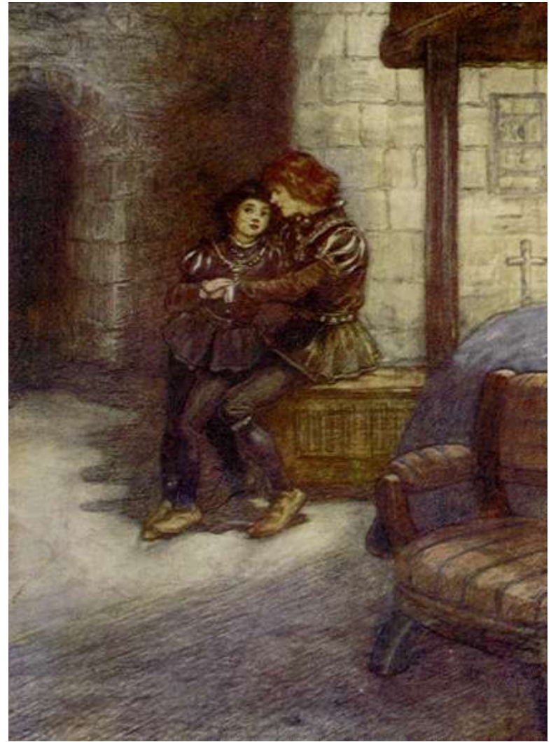
"THE DAYS SEEMED VERY LONG AND DREARY TO THE TWO LITTLE BOYS"

That night the little Princes went to sleep with their arms round each other's necks, each trying to comfort the other. They lay together in a great big bed, happy in their dreams, with tears still wet upon their cheeks.