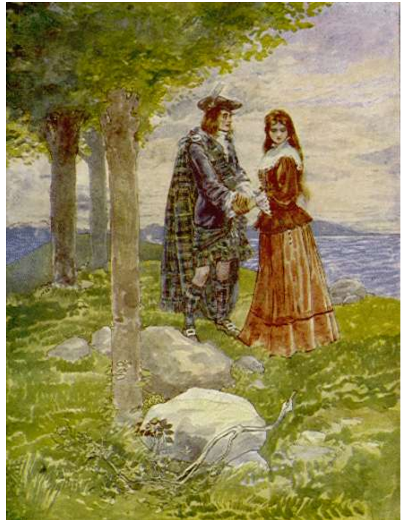
They took a sad farewell of each other.

When there was no need for Flora to go further with the Prince, they took a sad farewell of each other. “I hope, madam,” said he, bending over her hand and kissing it, “we shall yet meet at St. James’s.” By that he meant that he still hoped to be King some day, and welcome her in his palace of St. James’s in London. Then he stepped into the boat which was waiting for him, and Flora sat sadly by the shore, watching it as it sailed farther and farther away.