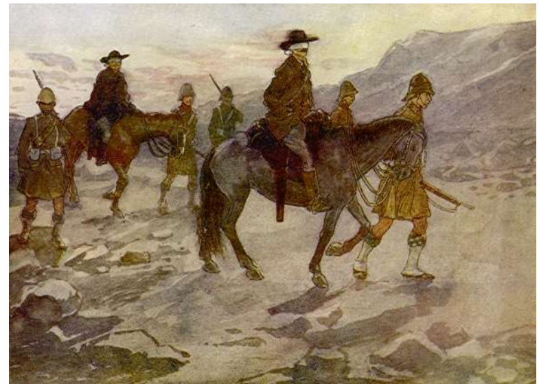
The Boer leaders were blindfolded and guarded by soldiers of the Black Watch.

But in the darkest hour one thing became certain. The little island was not fighting alone. The Empire of Greater Britain was no mere name. From all sides, from New Zealand, Australia, Canada, from every province of Greater Britain, from every land over which the Union Jack floats, came offers of help. Britain was fighting, not for herself, but for her colony, and right or wrong, her colonies stood by her, side by side, and shoulder to shoulder.