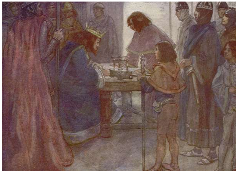
The Great Charter was sealed with the King's seal.

The angry barons would no longer be put off. They forced the King to meet them at a little place on the Thames called Runnymede. The barons and their army camped on one side of the river, the King and his friends on the other. On a little island between, they met and talked, and there, on 15th June 1215 A.D., the Great Charter was sealed with the king's great seal.