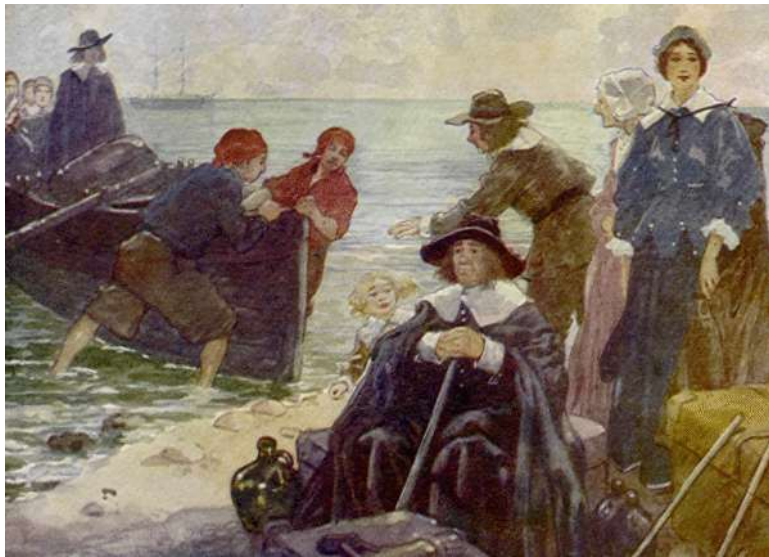
"A band of exiles moor'd their bark on the wild New England shore."

Yes, call it holy ground, which first their brave feet trod! They have left unstain'd what there they found, freedom to worship God!