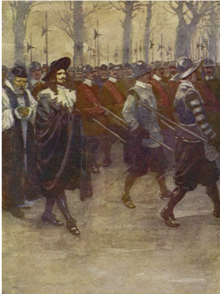
CHARLES THE KING WALKED FOR THE LAST TIME THROUGH THE STREETS OF LONDON

thought that he was going to friends, he found that he was again a prisoner, and more carefully guarded than before.