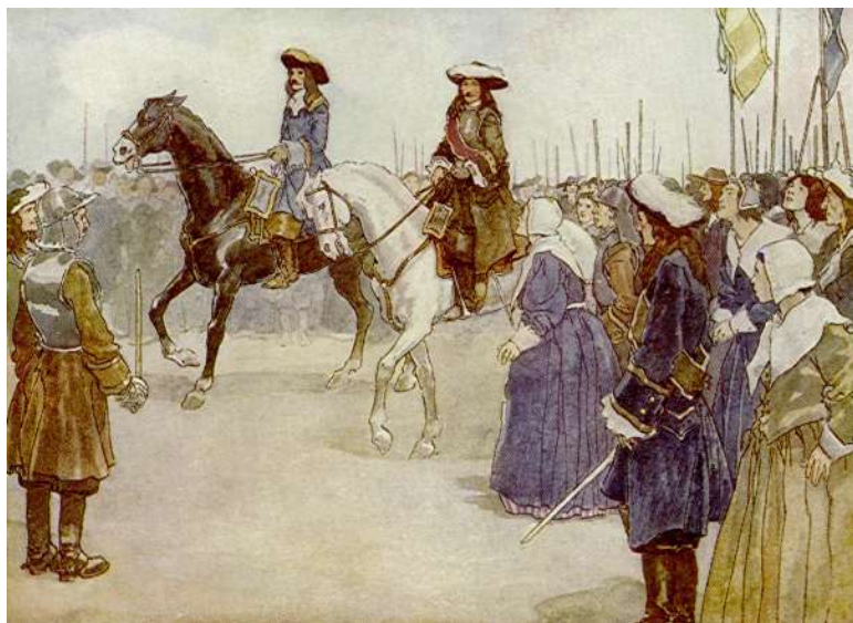
The Deliverer had come.

On the 5th of November 1688 A.D., William landed at Torbay, in Devonshire. There the stone upon which he first placed his foot is still to be seen. Although now it is a town, then it was a little lonely village, and the Prince had to sleep the first night in a tiny thatched cottage. But over it, as proudly as over any castle, fluttered the great banner with its promise, "I will maintain the liberties of England and the Protestant religion."