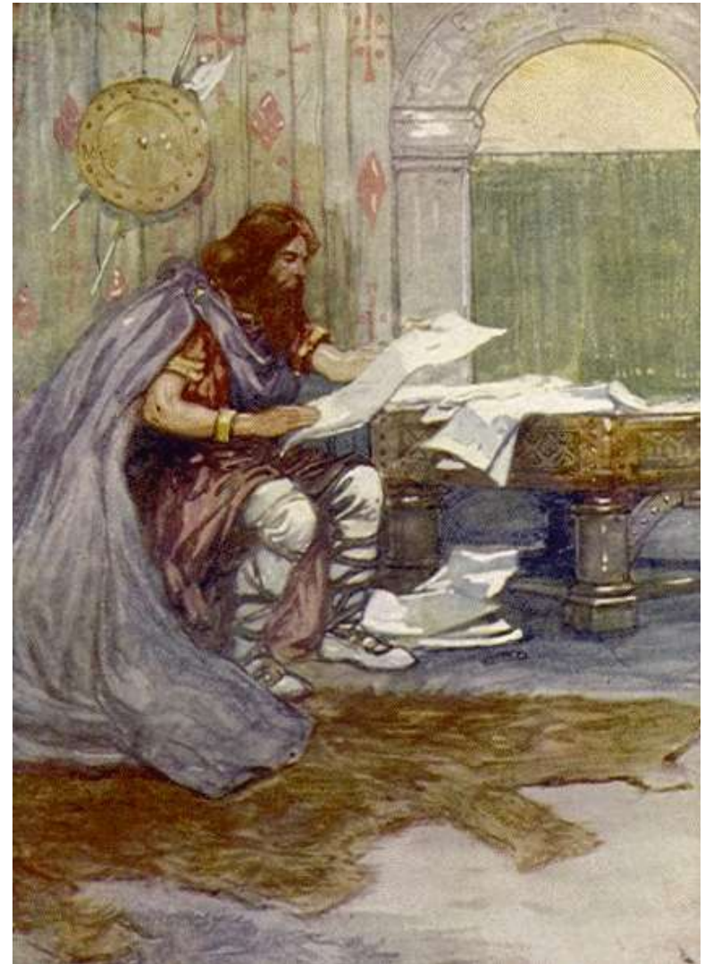
"ALFRED FOUND MUCH PLEASURE IN READING."

the English to make all kinds of things, in order to trade with these far-off countries. In fact, during all his life Alfred was thinking only of his people and of what was best for them.